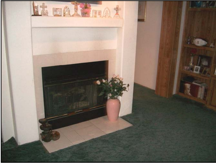
Fireplace in living room