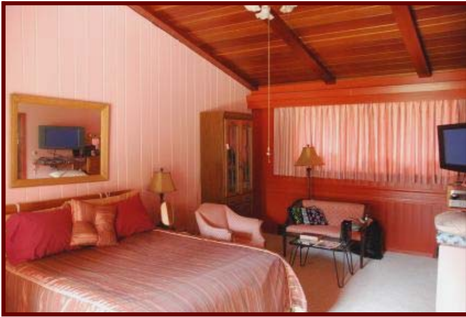
Master bedroom with large picture window and cedar closet.