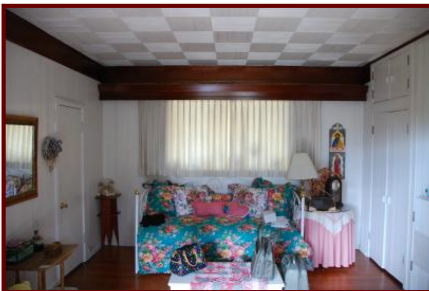
Second bedroom with built-in dresser, 2 cedar closets and attached bathroom.