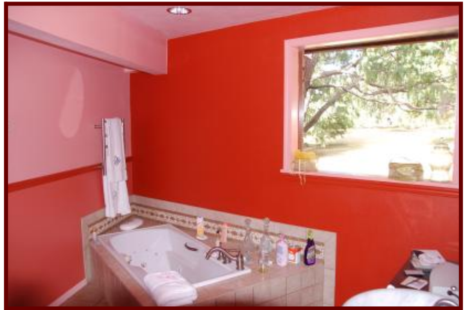
Master bathroom with whirlpool tub, heated toilet, floor and towel holder.