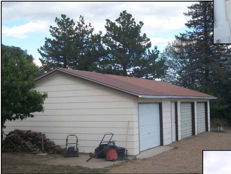
3 Car Heated Garage

Very nice views On a large lot with room for RV and boat parking. Country-like living in town.