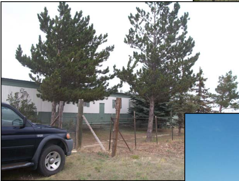
Nine various sized parcels of land are included in the purchase!