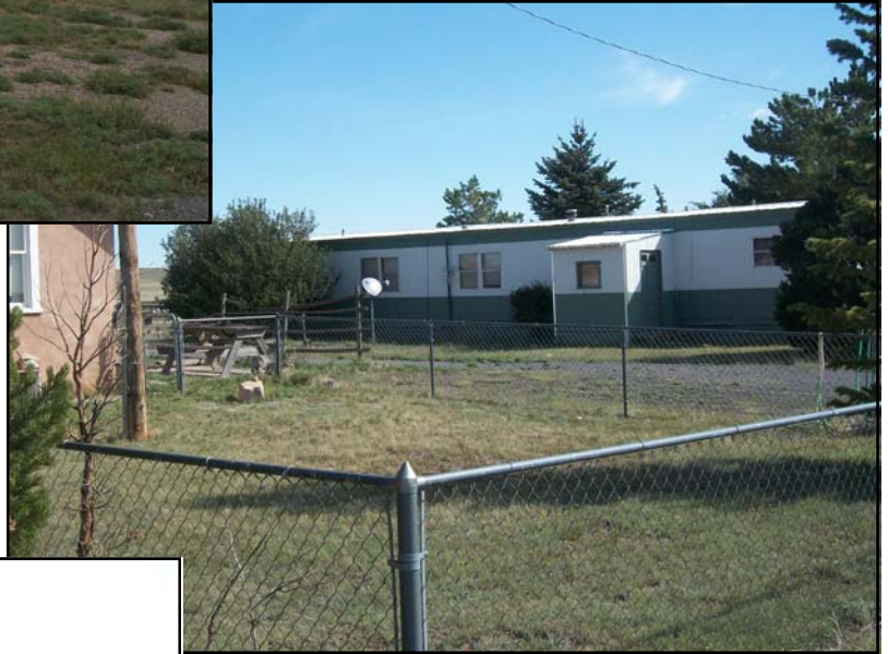
Lots of upgrades