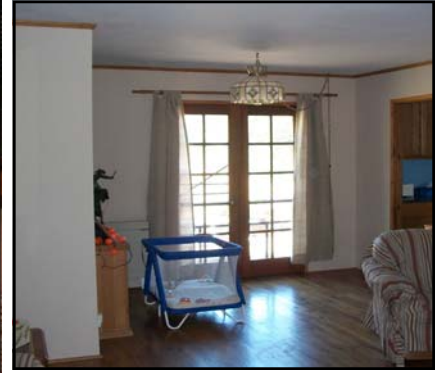
Beautiful 3,257 square foot 3 bedroom, two bathroom home.